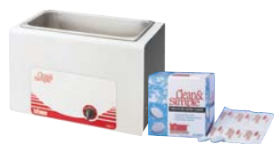
Clean&Simple™ Ultrasonic Cleaners and Tablets

Documents: date, time, temperature, pressure.