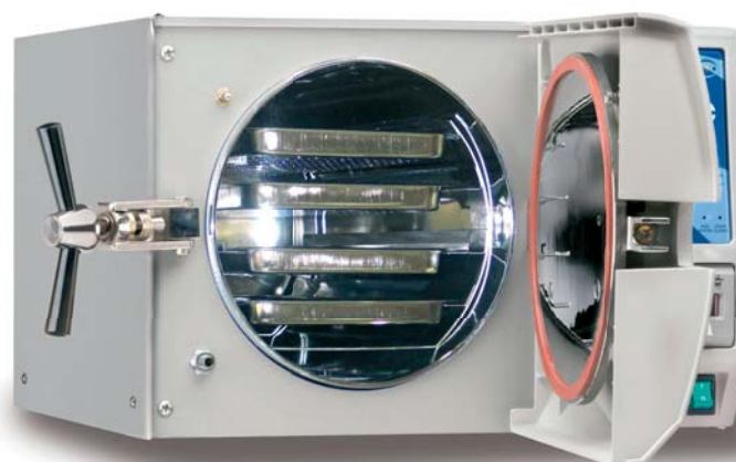
EZ10 with 4 large trays

* Above photo shown with optional printer