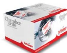
Chamber Brite Autoclave Cleaner