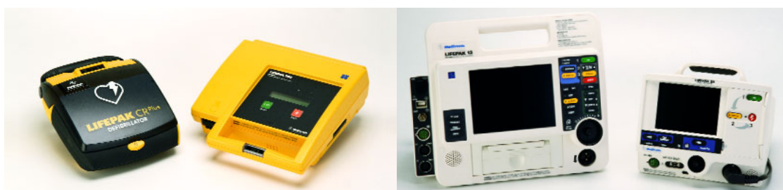
LIFEPAK® CRPlus Automated External Defibrillator

The 20 extends and enhances the LIFEPAK family of products, providing flexible, compatible and standardized defibrillation solutions for patients across a range of hospital settings. The LIFEPAK family of products promotes efficient and smooth transitions through the levels of emergency cardiac care, with the ultimate goal of saving more lives.